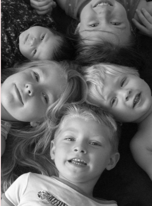
The kiddos are all growing strong and happy! We are so blessed!

Joshua 1:9 Have not I commanded thee? Be strong and of a good courage; be not afraid, neither be thou dismayed: for the LORD thy God is with thee whithersoever thou goest.